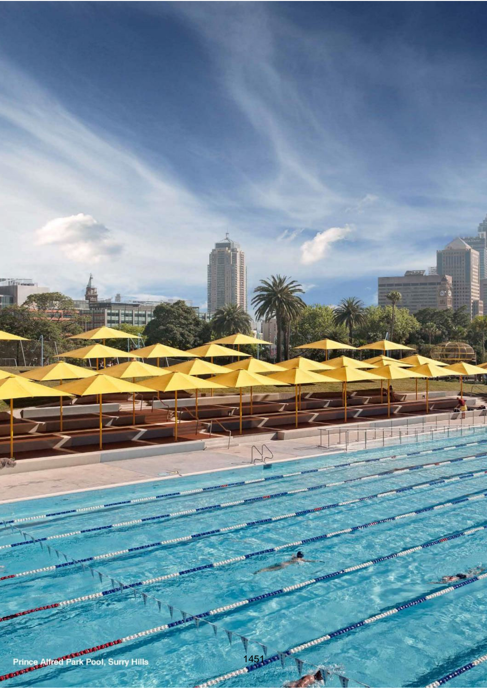
Prince Alfred Park Pool, Surry Hills