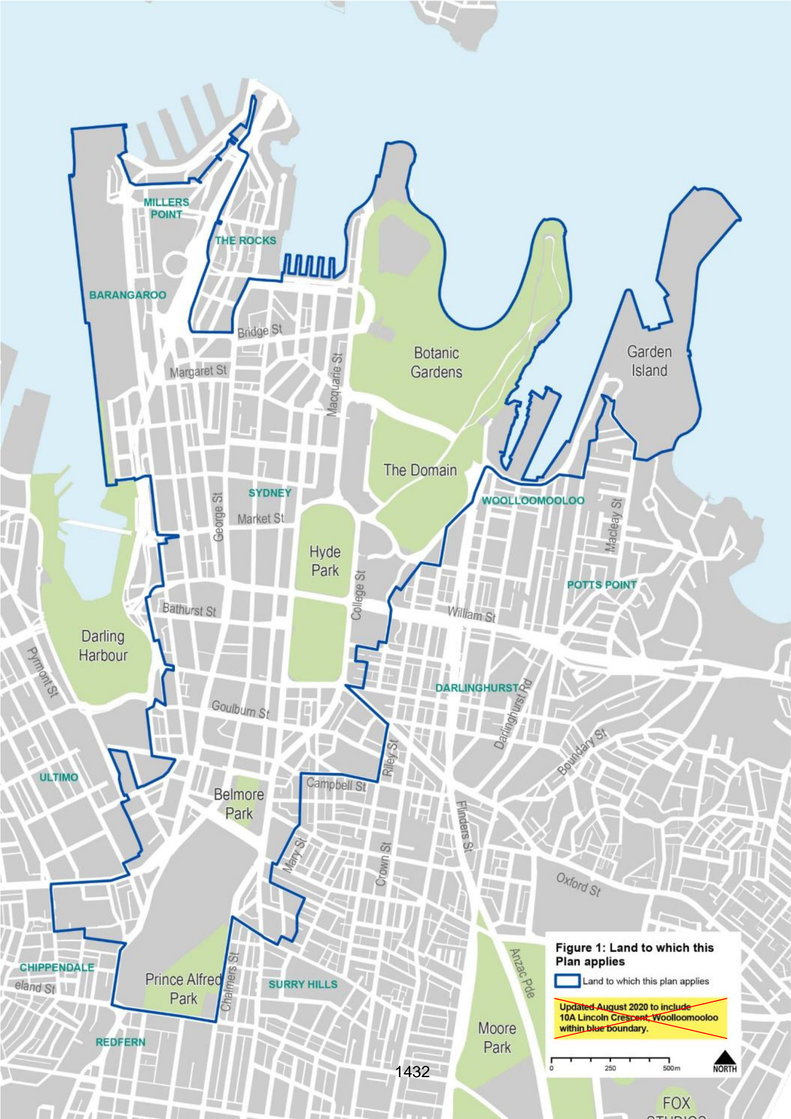
Figure 1: Land to which this Plan applies